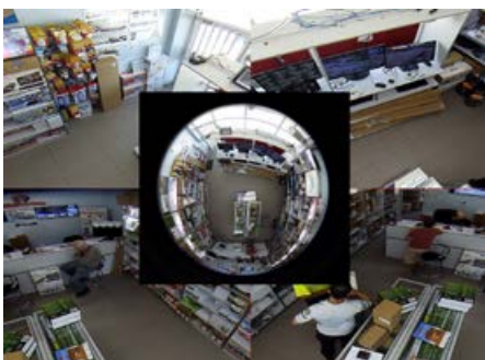
Fisheye Image Dewarp Modes