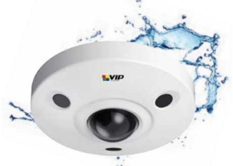
Vandal & Weather Resistant