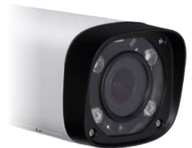
Long Range 60m Infrared