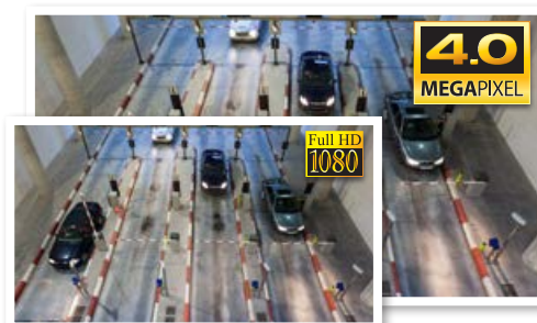
Double Full HD Resolution